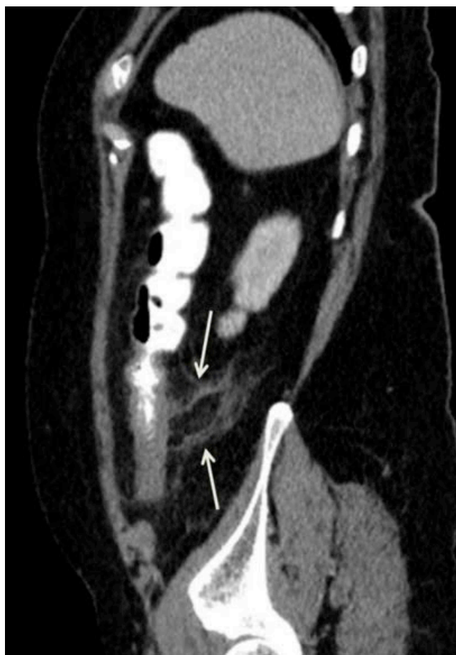
Figure 2. An oval lesion with an impression of peripheral rim which appears hypodense due to central fat density and hyperdense due to serosal inflammation is seen which suggests the presence of epiploic appendicitis in the posterior of the descending colon, and staining is viewed in the fat planes around the lesion.

or acute diverticulitis were detected. Following clinical improvement, the patient was discharged and outpatient clinic follow-up was recommended. Colonoscopy revealed normal findings 4 weeks following the initial abdominal findings.