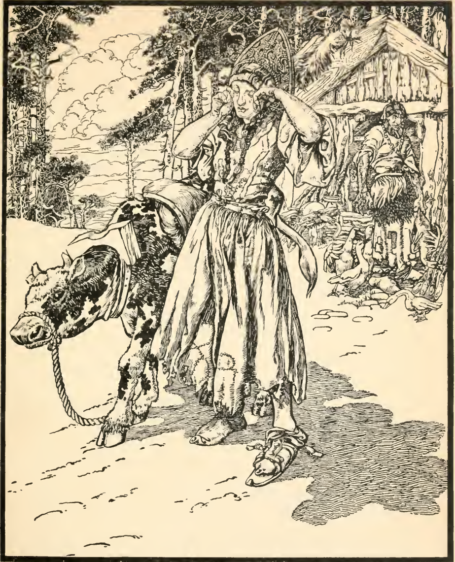
THE GIRL DROVE THE HEIFER OUT TO GRAZE