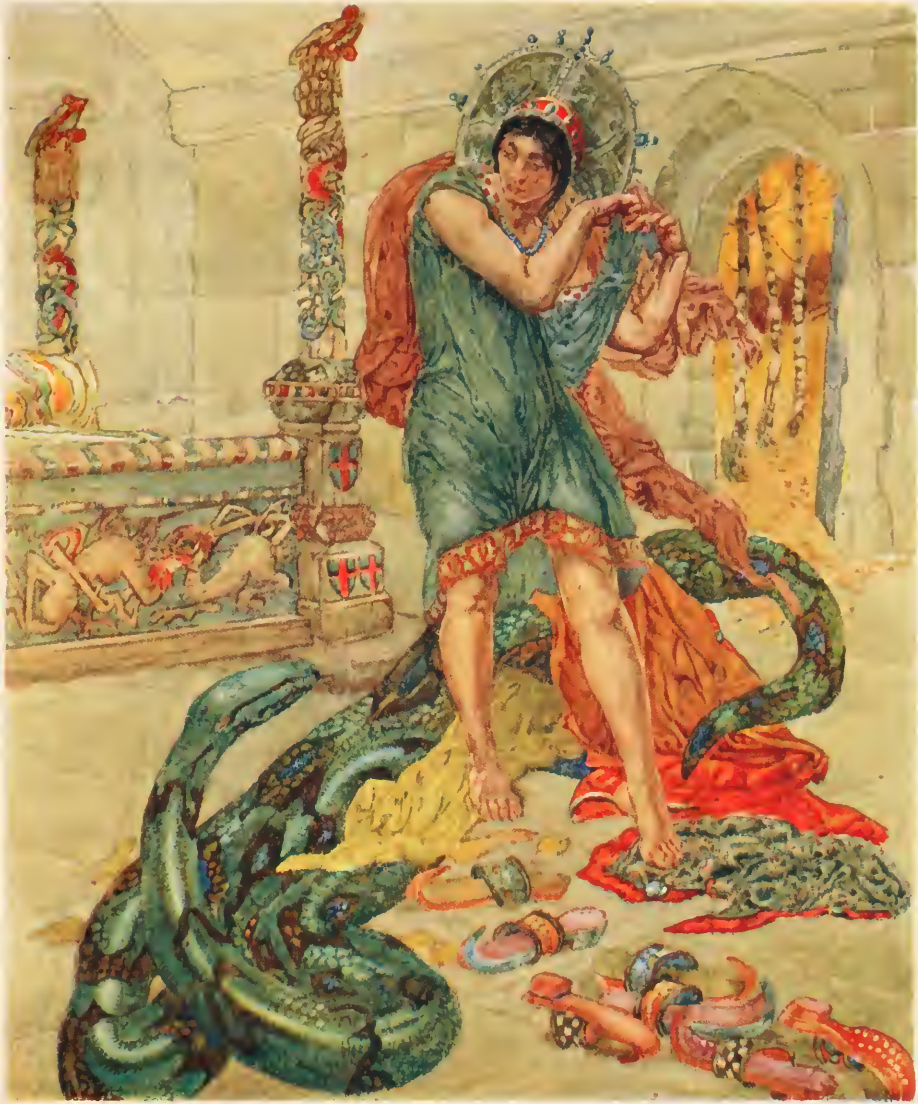
NINETEEN TIMES DID SHE CAST OFF ONE OF HER SUITS OF CLOTHES