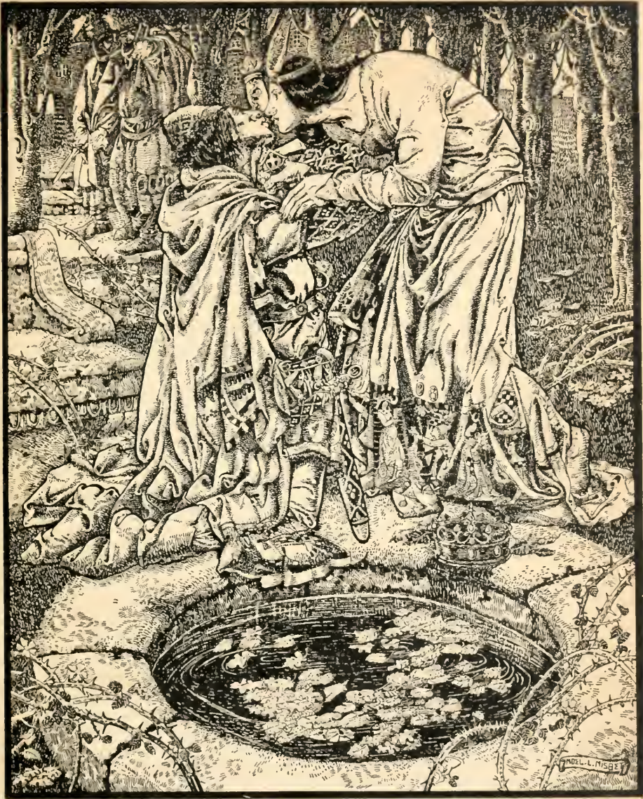
HIS WIFE CARESSSED AND WHEEDED HIM