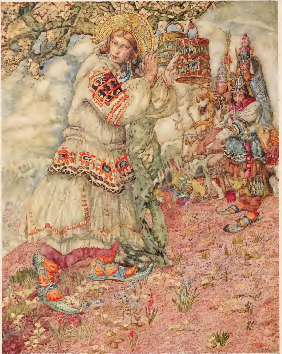
Fr THEY CAME TO THE PLACE WHERE HE HAD LEFT HER PAGE 79