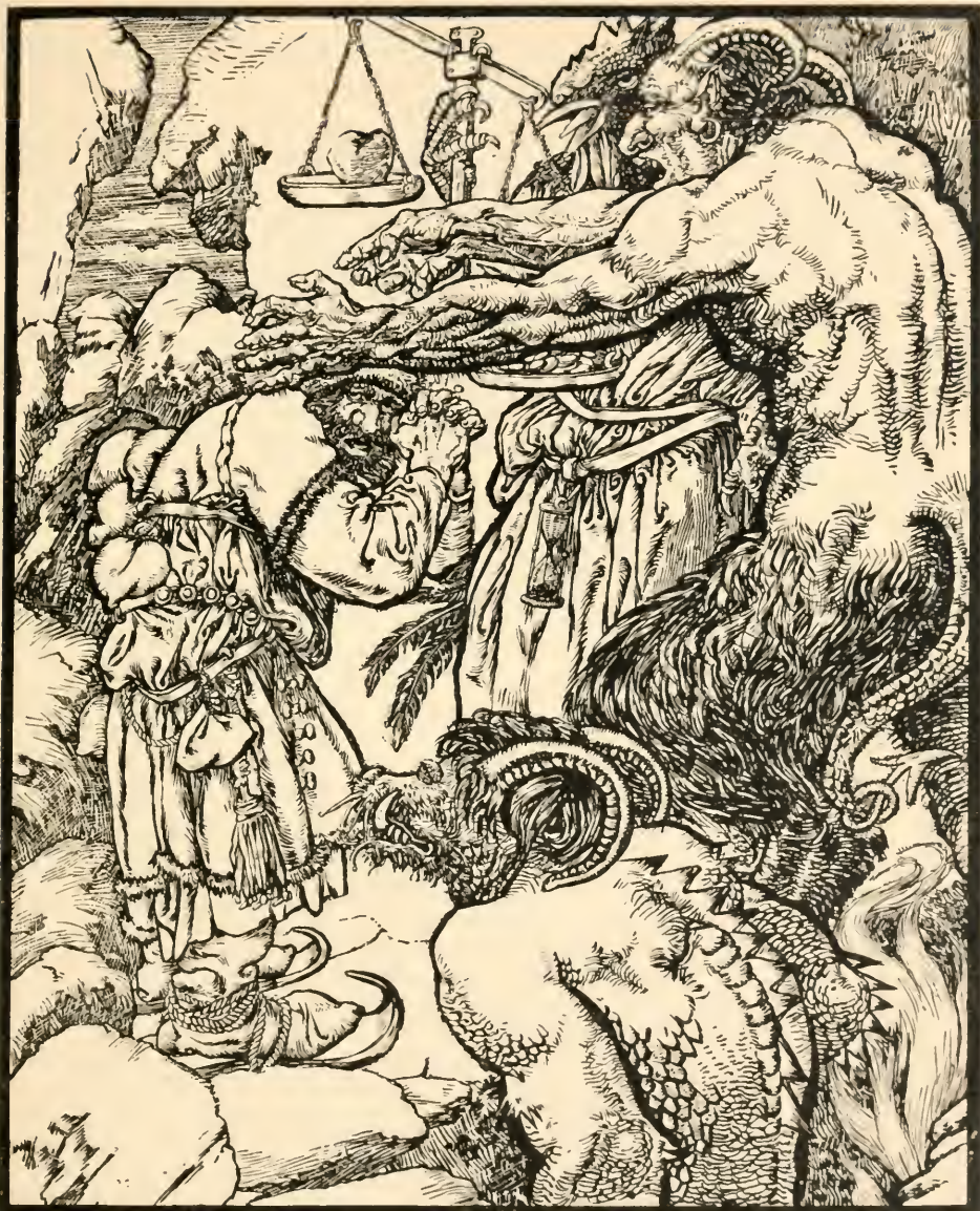
THE RULERS OF HELL LAID HANDS UPON THE OVERSEER STRAIGHTWAY