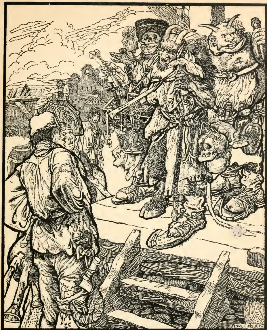
ALL MANNER OF EVIL POWERS WALKED ABROAD