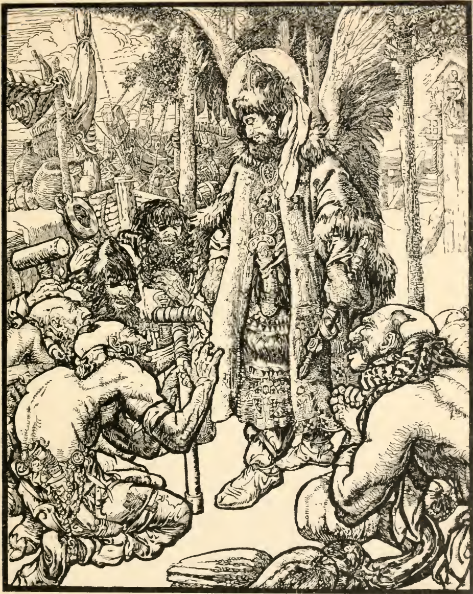
THE TSAR WENT ABOUT INQUIRING OF HIS PEOPLE IF ANY WERE WRONGED