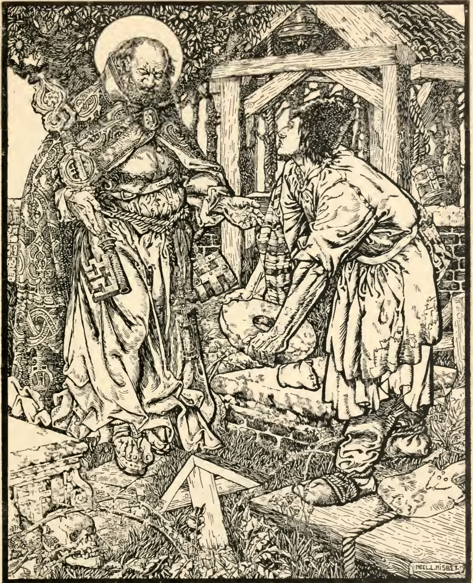
SUDDENLY ST PETER APPEARED TO HIM