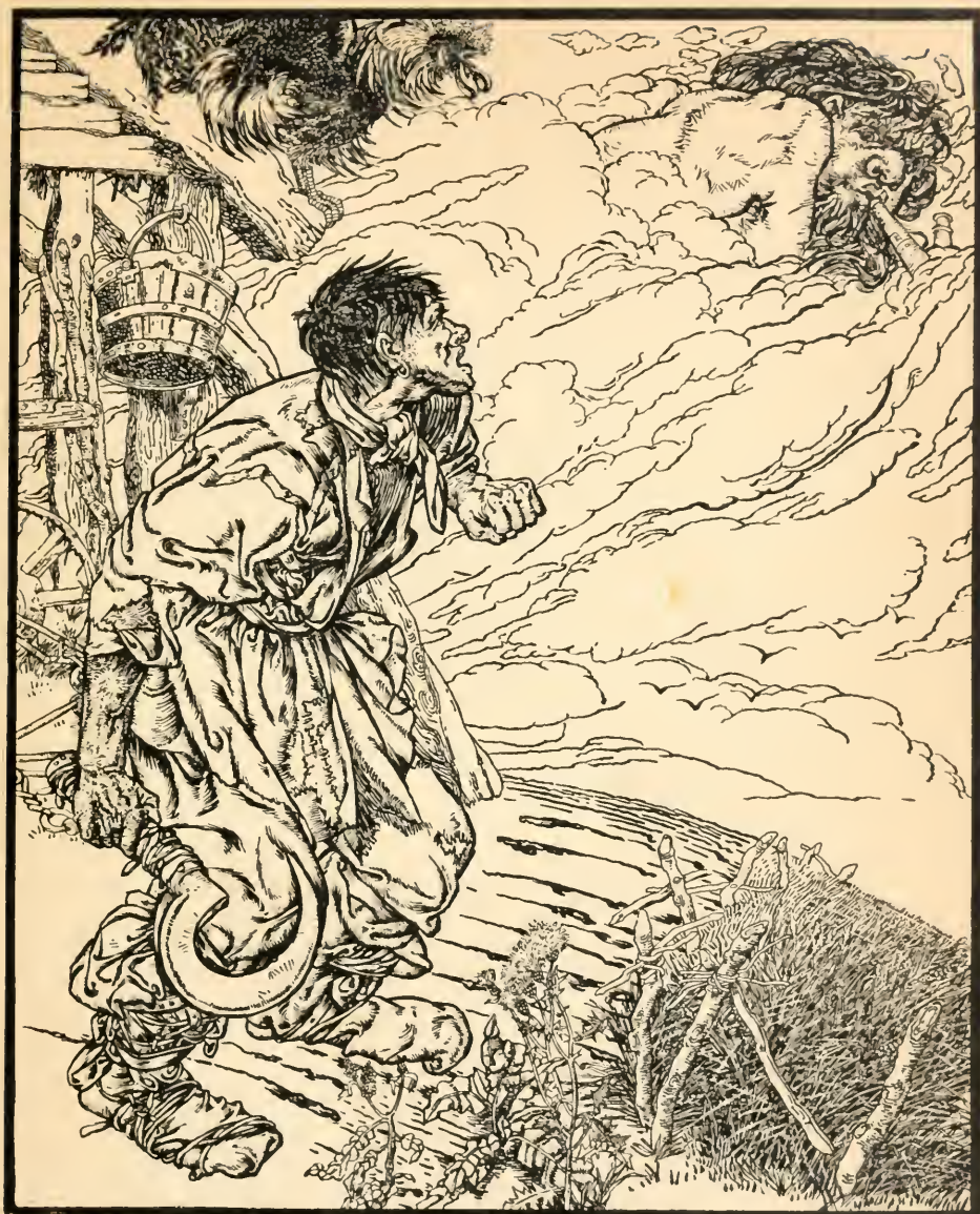
THE WIND CAME AND SWEPT ALL HIS CORN AWAY