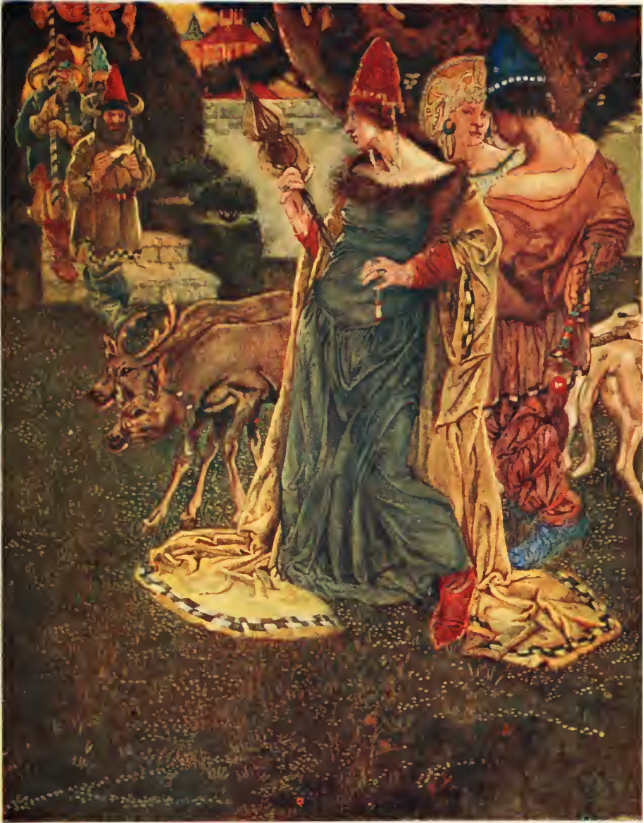
THE TSAR'S COUNCILLORS WENT TO THE HOUSES OF ALL THE NOBLES AND PRINCES