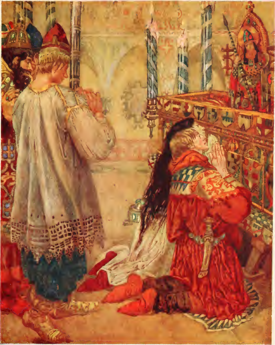
THEY WERE BOTH ON THEIR KNEES