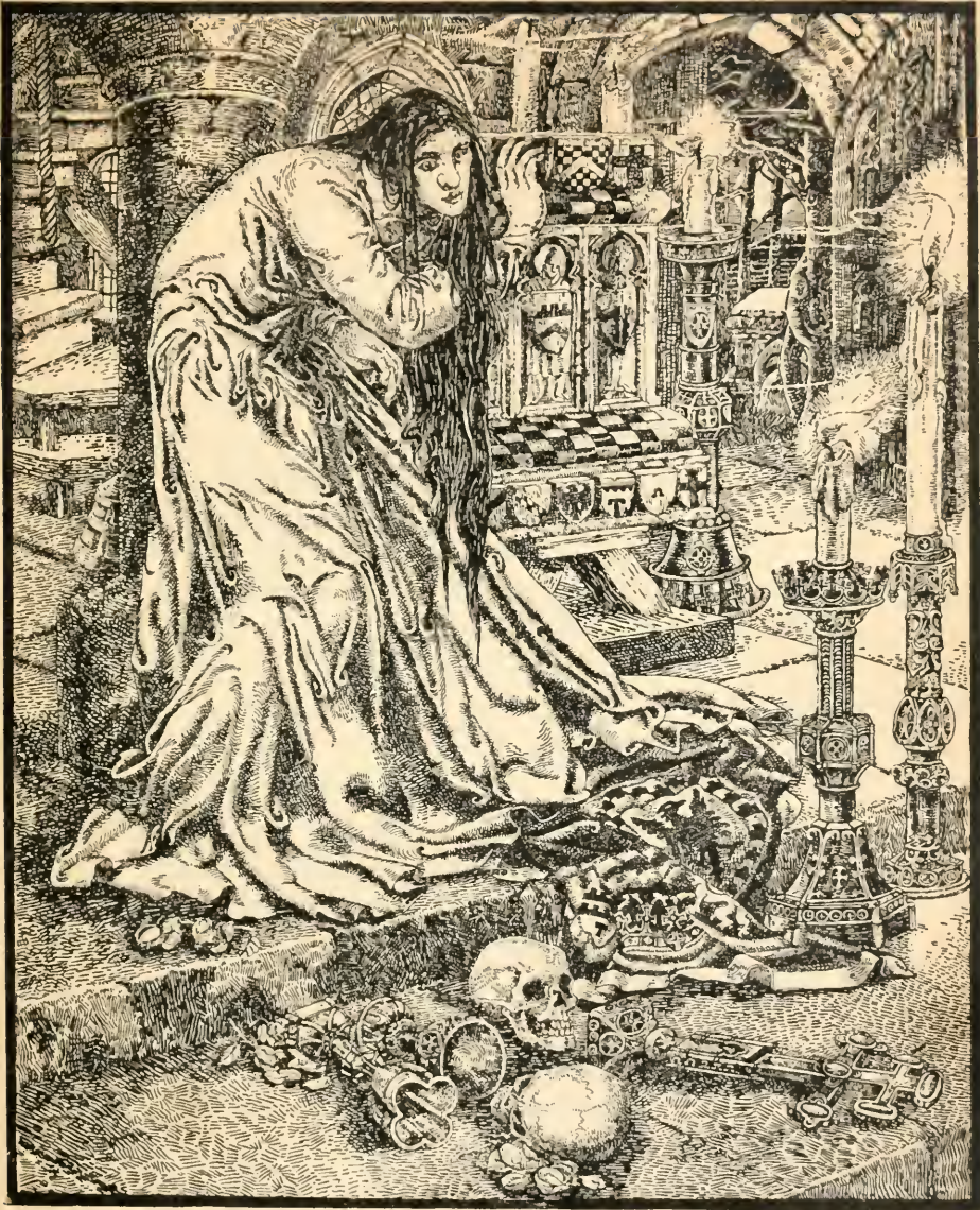
THE TSARIVNA AROSE FROM HER COFFIN