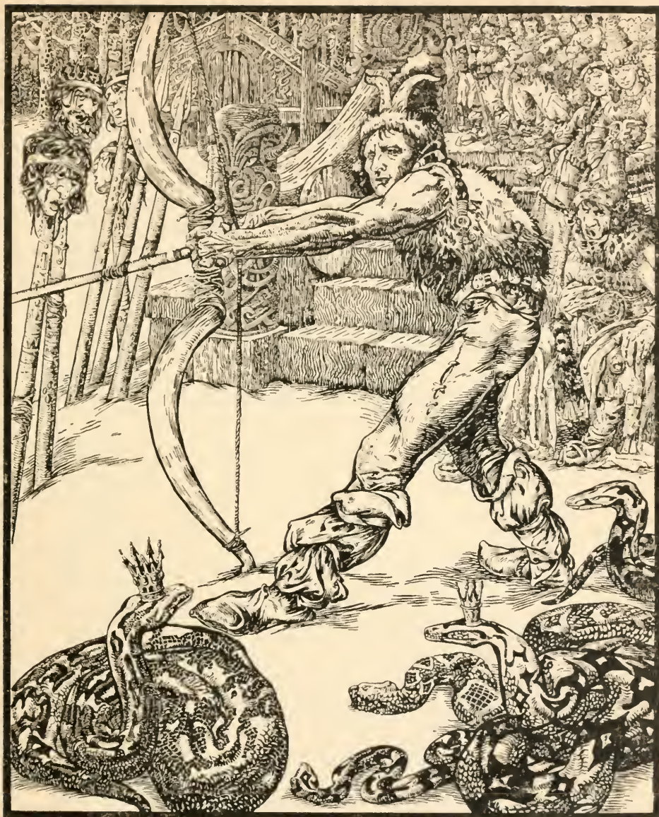
IVAN GOLIK DREW THE BOW